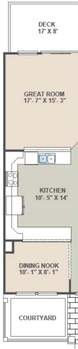
MAIN LEVEL w/ OPT. KITCHEN #2