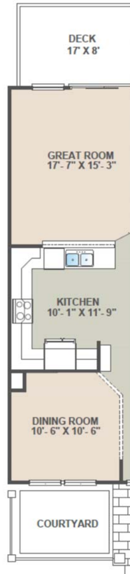
MAIN LEVEL w/ OPT. KITCHEN #3